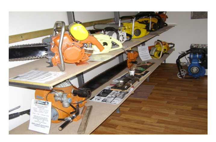
The chainsaw display includes a chainsaw mounted on two wheels. This saw was used by women during the Second World War in England.

One of the best CHAINSAWS displays in Queensland www.bauplemuseum.com