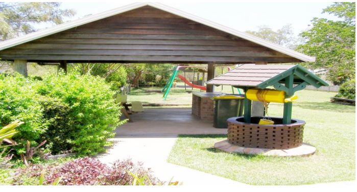
The Museum is set in a parkland with 2 free BBQ's, play ground area, machinery shed, loco, tractor, one of the first Land cruisers, cane growing equipment and a plumbing Machine and more.